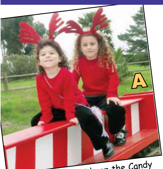
Where can you ride on the Candy Cane Train starting Nov. 23rd?

Where can you come face to face with the local and exotic?