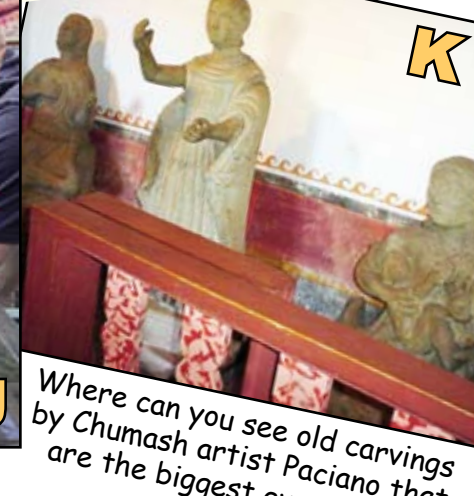
by Chumash artist Paciano that are the biggest ever made by California Indians?