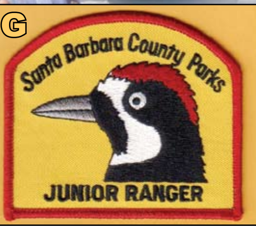
to care for the outdoors, to earn a badge, and to become a Junior Ranger?

Now Try This: Identify each of the Passport destinations shown in the photos. There are many other places you can visit to fill your Passport; choose from the list below. Answers are at the bottom of the page.