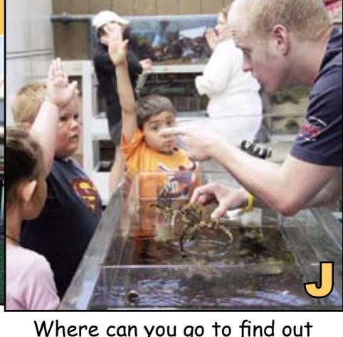
Where can you go to find out what Rockfish, Lobsters, and Abalone all have in common?